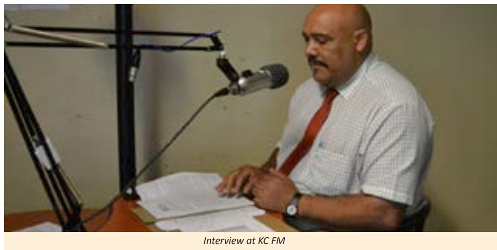
Interview at KC FM