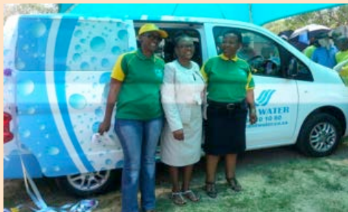
The principal of Siloe School for the Blind (in the cream suit) with some of the educators in front of the MV combi donated by Rand Water in partnership with Limpopo Nissan BB Auto.