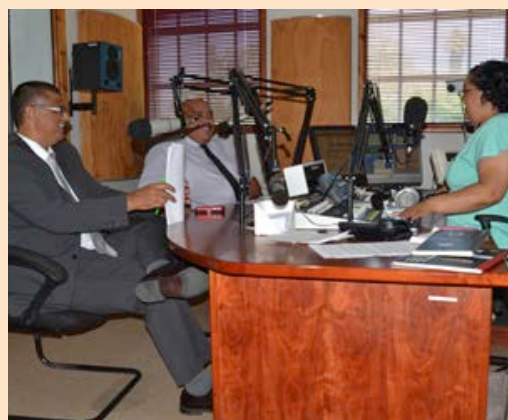
Interview at Valley FM