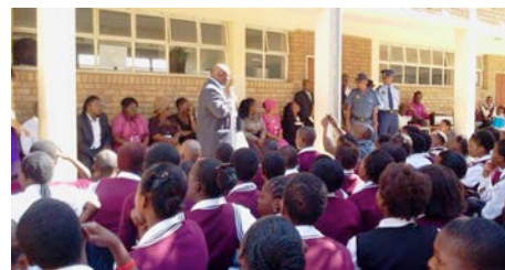
The Principal, School Governing Body, Cllrs from Ngwathe and officials from the Department of Education on the first day of school at Phiritona High School, wishing the Class of 2014 well.

The Free State is still riding on a cloud of euphoria because of beating eight other South African provinces, including those with technological and developmental advantage, to claim the best performing province in the 2013 Matric results.