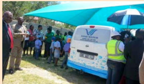
The Nissan MV 2000 Combi donated to Siloe School for the Blind.