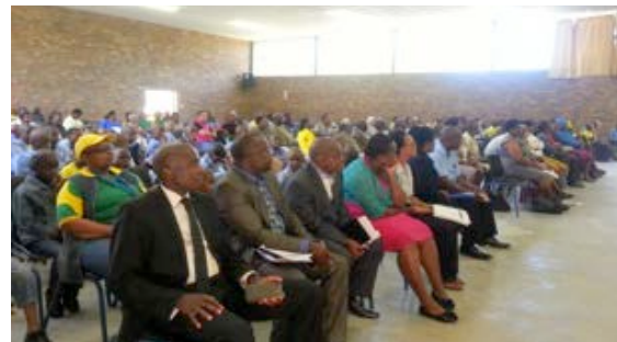
People who attended the occasion at the Siloe School for the Blind.