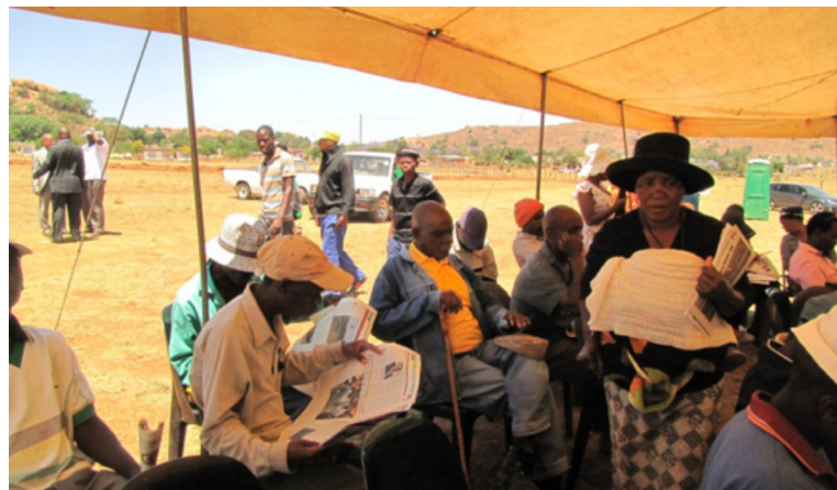
Some of the community members reading Vuk'uzenzele while waiting for the executive mayor during the handover of the VIP toilets.