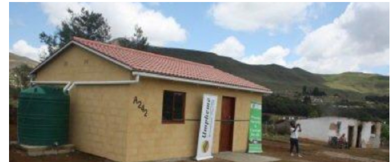
One of the newly built Rural Housing Development Project houses in Kilmun community in ward 1 of Ingwe.