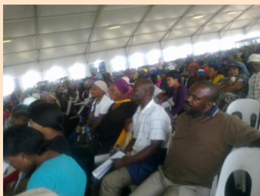
Some of the members who participated in the KwaZulu-Natal Legislature's visit.

The percentage of households in 2009 with access to water infrastructure above or equal to the Reconstruction and Development Programme standard increased from 61,7% in 1994 to 91,8% in March 2009.