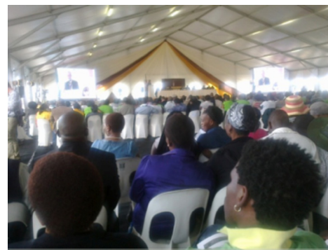
KwaZulu-Natal Premier Senzo Mchunu addressing the public.