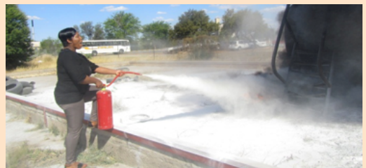
Dikeledi Moiloa busy fighting a fire.