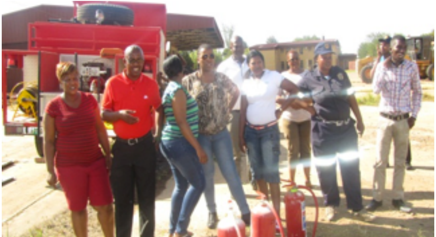
GCIS officials during the fire-fighting training.

GCIS officials in North West took part in intensive fire-fighting training at Mafikeng Local Municipality's Fire Department on 4 November 2013.