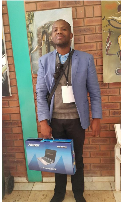
Proud Recipients of laptops from Vaaltar fm and Diamond fm