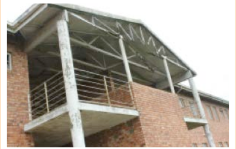
Part of the roof of the first-floor balcony falling apart.