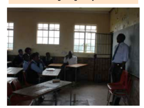
Lessons already under way in one of the classes visited.