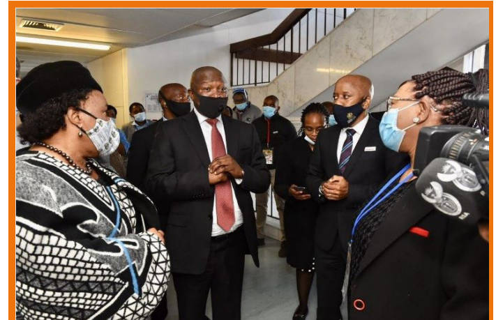
Deputy President Mabuza addressing the Free State leadership during his oversight visit to the province.

The Deputy President revealed that as the country operates on Alert Level 3 of the lockdown, the National Coronavirus Command Council has decided to embark on a proactive approach of ensuring that all parts of the country have effective measures to contain new infections.