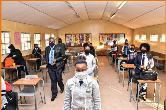
Classroom arrangements at Green Point High School.