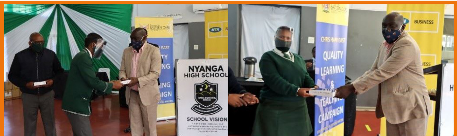
MEC Gade handing over tablets to learners.

The department committed to ensure that learners from special schools also receive tablets that are preloaded with assistive software. Situated in rural parts of the province, Nyanga High School is among the best performing schools in the Eastern Cape.