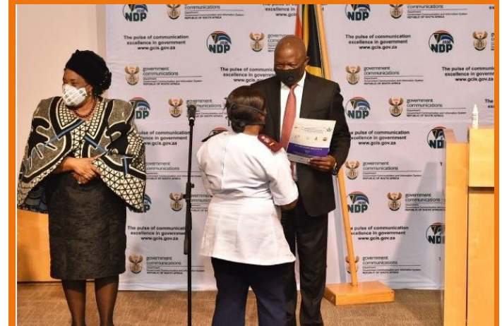
Deputy President Mabuza handing over an appointment letter to one of the newly appointed nurses.