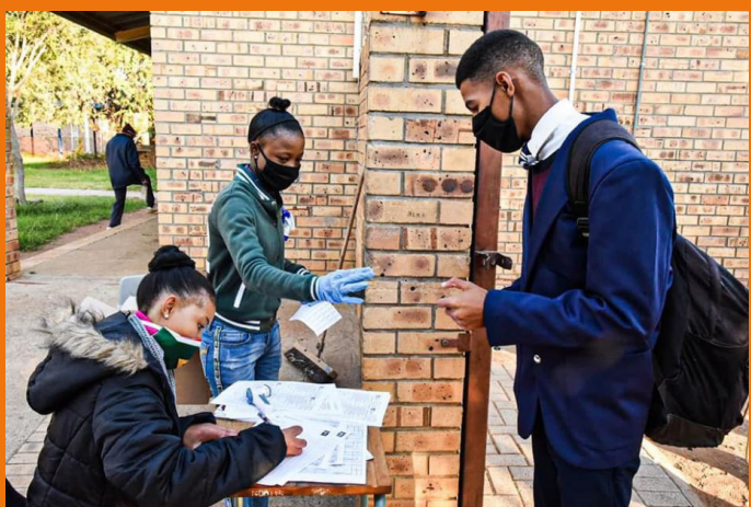
Upon arrival, pupils were requested to complete a COVID-19-related questionnaire, sanitise their hands and undertake temperature screening.